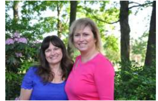
PACM's President and President Elect