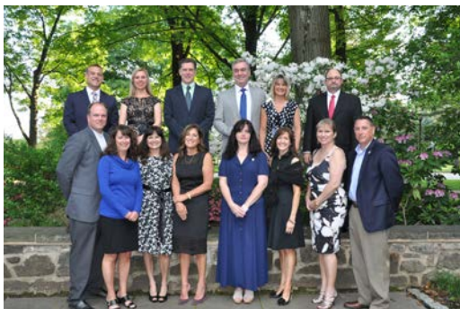
2016 - 2017 Board of Directors