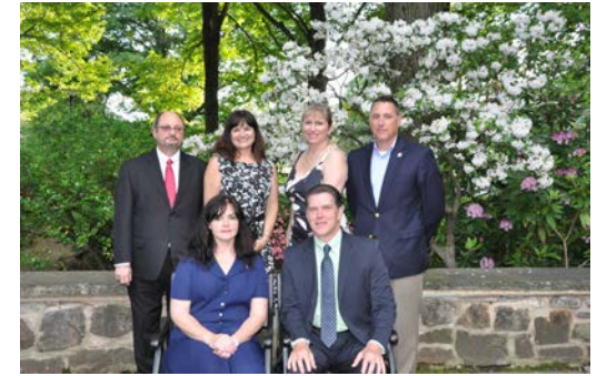
PACM's Executive Board 2016 – 2017